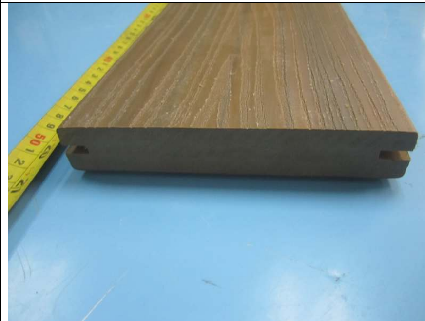
Section view of US07