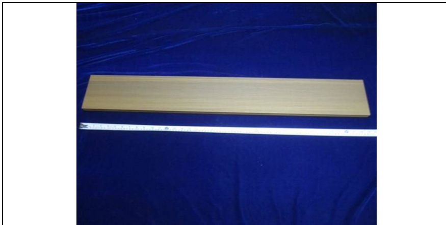
Front view of UH02 (tested surface)