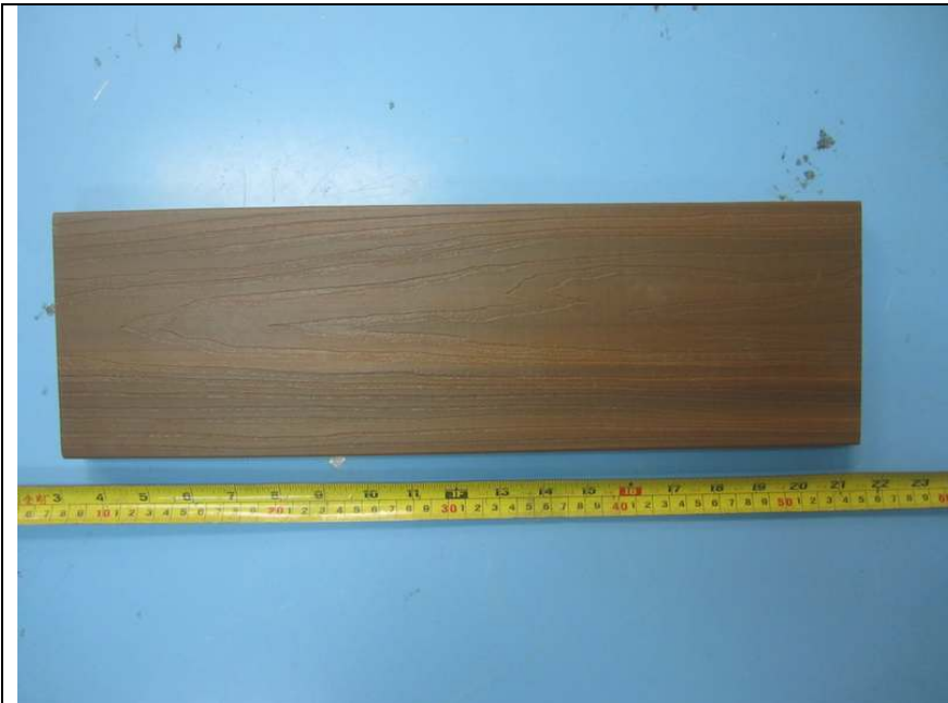
Front view of US07