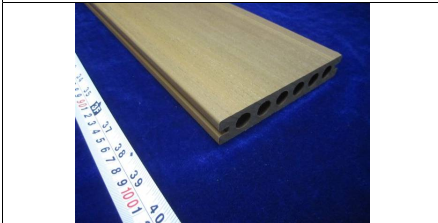
Section view of UH02